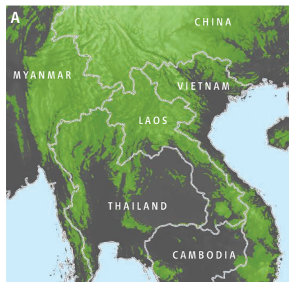
Swidden versus rubber. (A) Montane mainland Southeast Asia (green shaded areas) is defined here as the lands between 300 and 3000 m above sea level. (B) Most swidden fields and fallows on slopes near villages and roads in this area in Xishuangbanna have been converted to terraced rubber stands.

The conversion of both primary and secondary forests to rubber threatens biodiversity and may result in reduced total carbon biomass (3–5). Negative hydrological consequences are also of concern—for example, in the Xishuangbanna prefecture of Yunnan province, China—but current data are too sparse to quantify the extent of the impacts (3, 6). The effect of conversion to rubber on catchment or regional hydrology depends, in part, on the water use of rubber versus that of the original displaced vegetation. Another factor is the degree to which rainwater infiltration