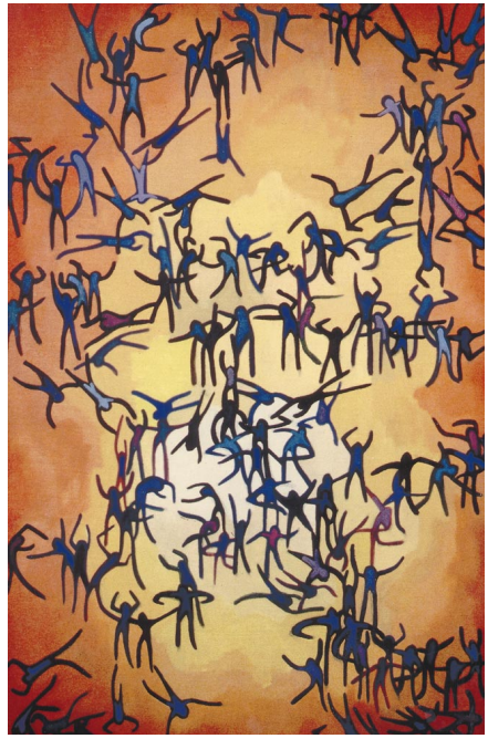
Figure 1 It's a small world: social networks have small average path lengths between connections and show a large degree of clustering. Painting by Idahlia Stanley.

partners, k_{\rm tot} in the respondent's life up to the time of the survey. This value is not relevant to the instantaneous structure of the network, but may help to elucidate the mechanisms responsible for the distribution of number of partners. Figure 2b shows the cumulative distribution, P(k_{\rm tot}) : for k_{\rm tot} > 20 , the data follow a straight line in a double-logarithmic plot, which is consistent with a power-law dependence in the tails of the distribution.